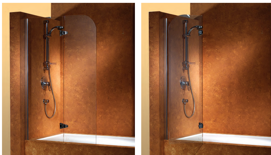
Unique hinge design allows the leading panel to swing through 180°, providing easy entry/exit from bath.